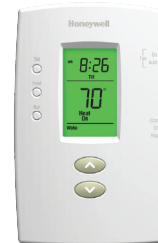
PRO 2000 Vertical Programmable