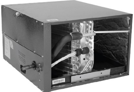
CHPF Horizontal "A"