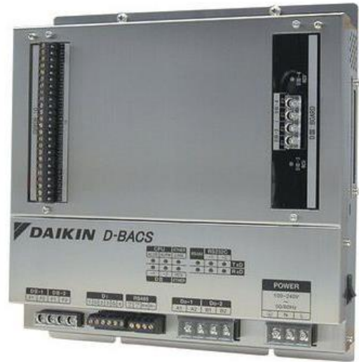
Notes: Image shows BACnet Interface (DMS502B71) with Optional DIII Board (DAM411B51) inserted