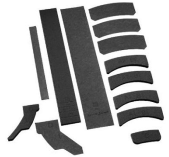
Note: Actual materials included may differ from photo

Sealing Material for Air Discharge Outlet, Sensing Flow Panel KDBHQ55B140